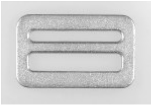
1238 Adapter, Harness Strap, Uneven Slide Military/Parachute 1238-1 PS22047-1 1238-2 PS22047-2 Fall Arrest/Safety 1238-1S 1238-1G