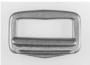
1246 Adapter, Reversible, Quick Fit Military/Parachute 1246-1 PS22019-1 Fall Arrest/Safety 1246-1S