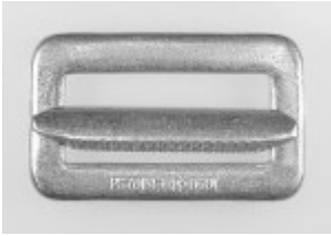
1236 Adapter, Quick Fit, Small Frame, Racing Racing Harness 1236-1S