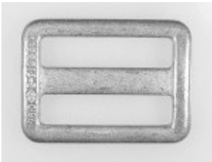
1245 Adapter, Parachute Harness Adjusting Strap Military/Parachute 1245-1 PS22014-2 Fall Arrest/Safety 1245-1S